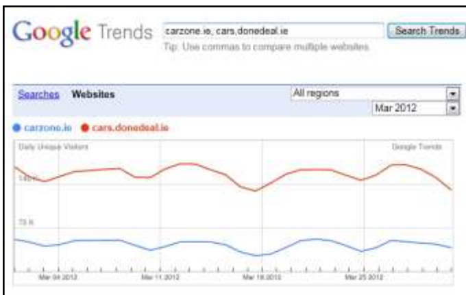
Google Data, March 2012