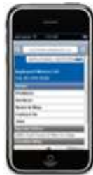
and Mobile site