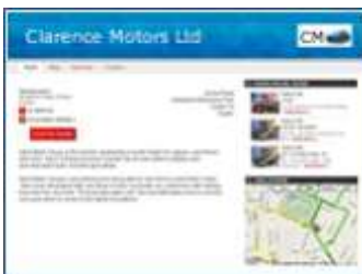
Your own full size site