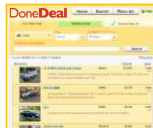
DoneDeal (see below*)